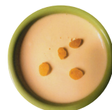
MISHTI DOI ONLY £4.95

All set meals are served with popadoms & pickle tray